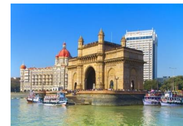
Mumbai Gateway to India