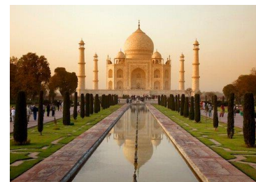
Taj Mahal in Agra